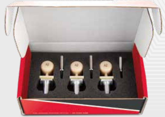
Sold in 3-block packs that include 3 single-use burs